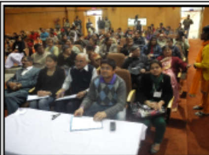
Judges are busy in selecting winners list