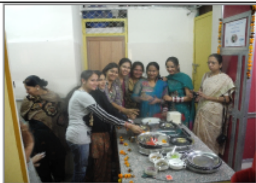
All young girls registered for this course