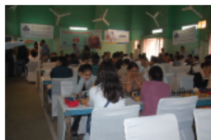
A large no. of chess participants had took part in the Event