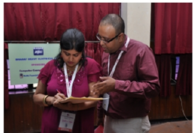
BHEL's Banner was displayed announcing Sponsorship for Computer Course