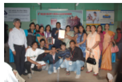
DFDW's Team won Championship Trophy