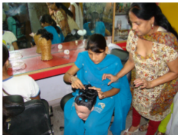
Hair Styling Course