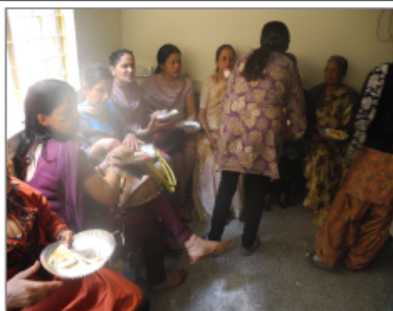
The tasty but hygienic bread sandwich were served to the participants

The young girls registered their names for Cooking class and the classes were conducted thrice a week under the guidance of expert cook . The NCT of Delhi Govt in the Deptt. Of Women and Child Development was kind enough to sanction grant to reimburse expenses on purchase of edible things and cooking items .