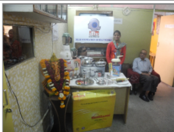
Photo shows new kitchen wares and utensils for cooking class