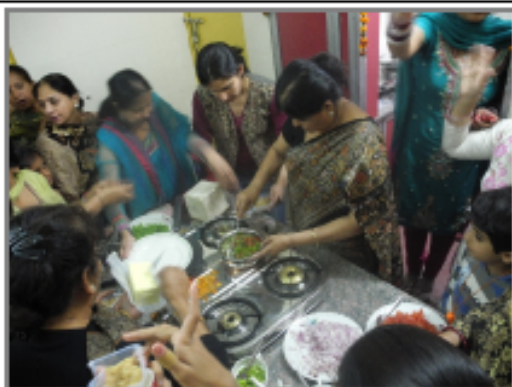
Girls watching keenly on the cooking method