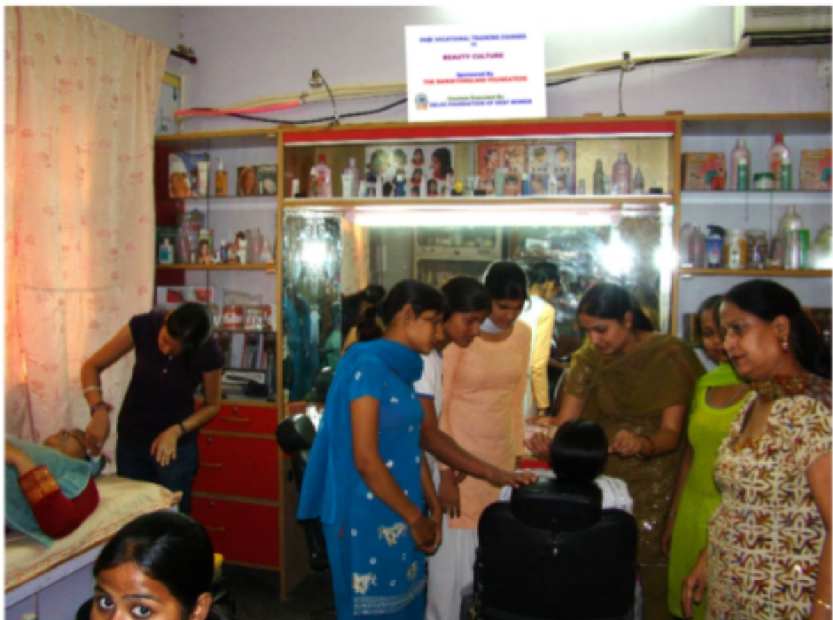
Ram Jethmalani Foundation Banner is displayed in Beauty Classroom

Courses Executed By DELHI FOUNDATION OF DEAF WOMEN