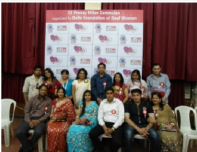
Newly Wed Couples of last year PMS were felicitated with wedding Gifts