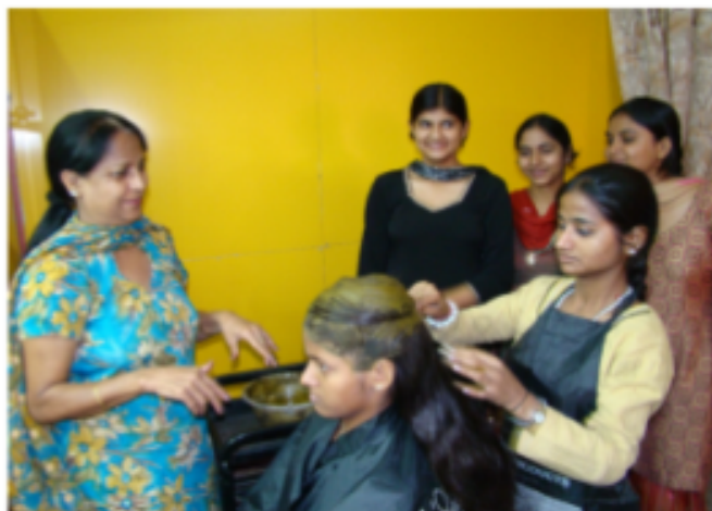
Hair coloring with Mehendi