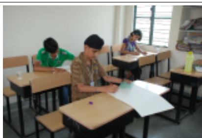
Our students participating in drawing competition