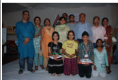
DFDW's Deaf boys and girls who participated in the event