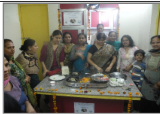
Teaching how to make tasty quick B.F.