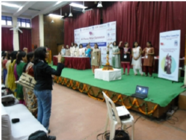
Video on Silent National Anthem performed by Deaf Children was shown during the opening ceremony of the XX PMs