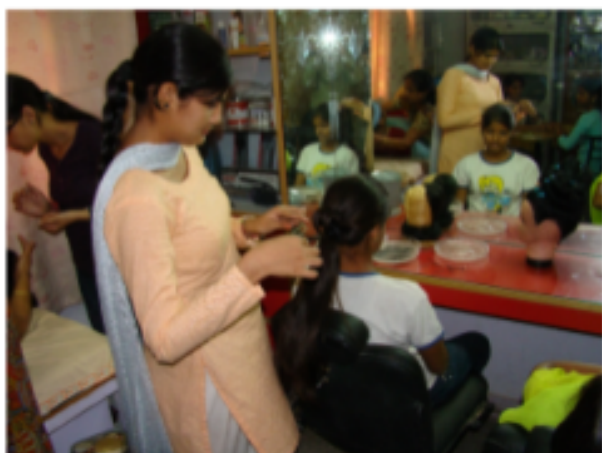
Practice in Hair styling