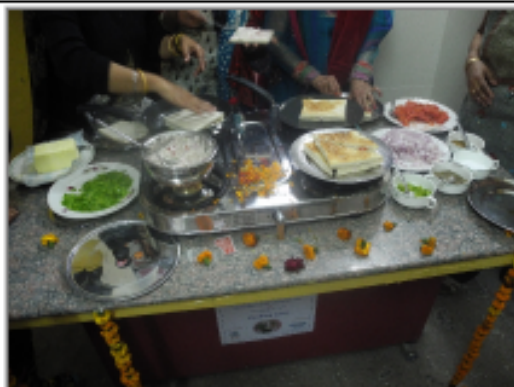
Ingredients used for making Break fast