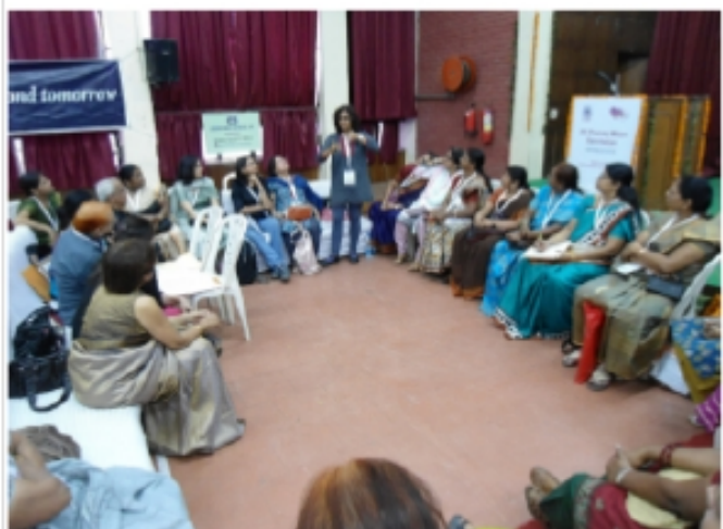
At the conclusion of the XX PMS a General Body Meeting of All India Foundation of Deaf Women was conducted. Delegates from 12 States Foundation took part in it