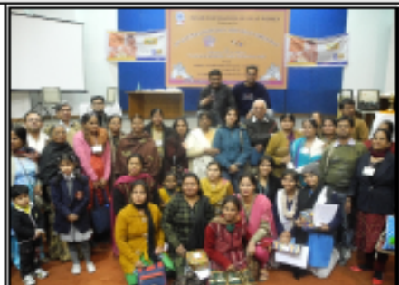
Group Photo of officials and volunteers

Special Thanks to the Rehabilitation Council of India, Ali Yavur Jung National Institute of Hearing Impaired, Punjab National Bank and Steel Authority of India and ONGC for extending their financial as well morale support to make our Events a great success.