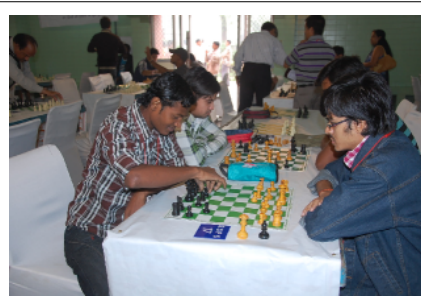
DFDW's Students playing in Chess Competition