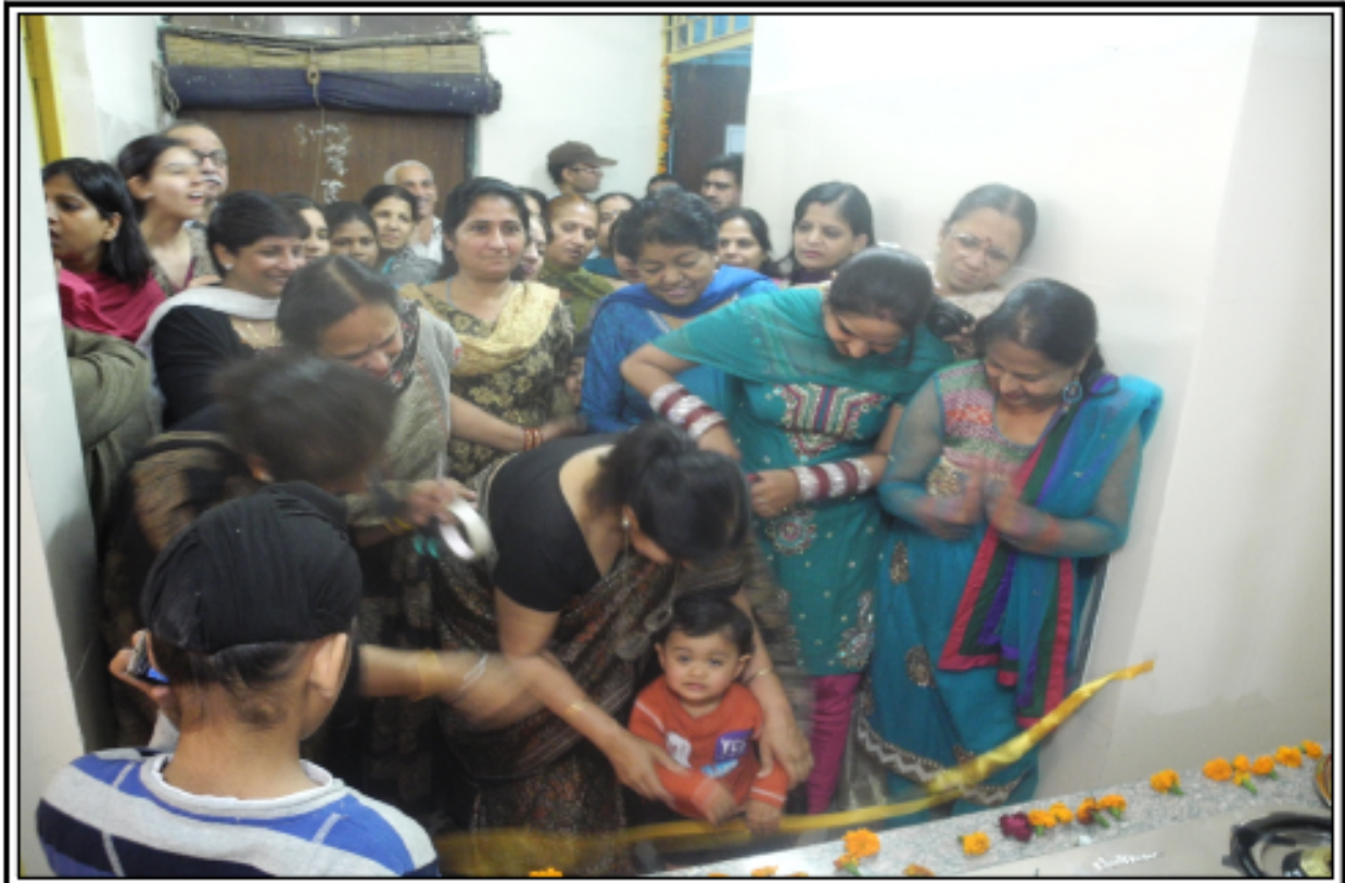
Inauguration Ceremony of Cooking class by a grandson of a deaf couple on occasion of International Women's Day on 10 th March 2012