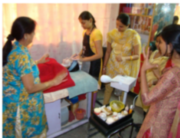
Practice in facial