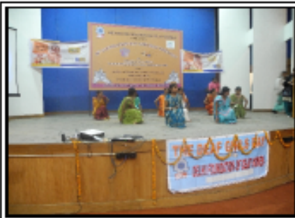
Cultural Performance by Deaf school children