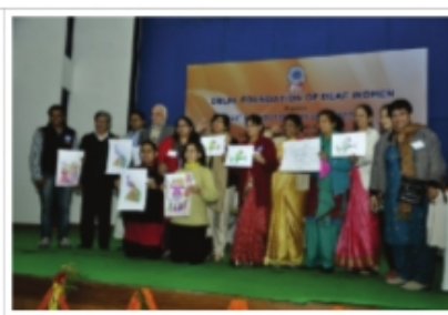
Displaying Paintings made by school children .