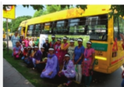
The students posing photographs

Tri – colour Flag was installed inside the park side and decorated with flower malas, The secretary delivered a speech on Independence Day topic and every one paid tribute to Mt. Gandhiji and the Great Shahids. The members enjoyed dancing and fun and tasty food. Prizes were distributed to the winners.