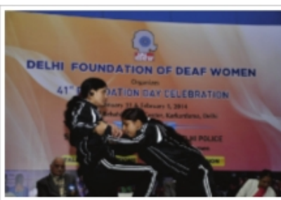
Self Defence Demonstration by Delhi Police