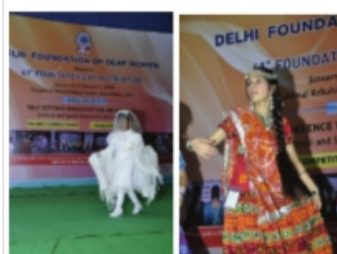
Fancy Dress Competition