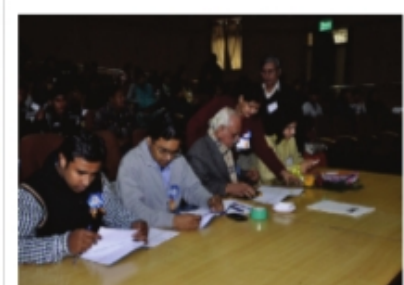
Judges busy in selecting winners list