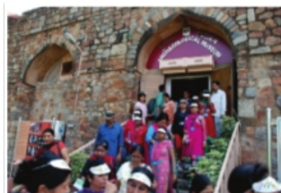
At the Purana Qila Museum