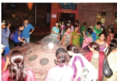
At the National Science Center