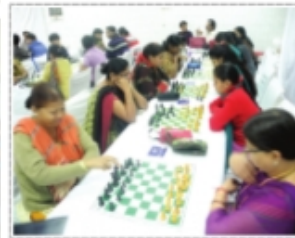
DFDW members busy in chess playing competition