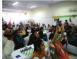
A large no. of chess players took part in the chess event